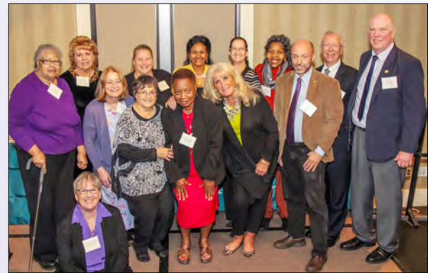
The Vinfin Family Advisory Council celebrated the event's 10th year.