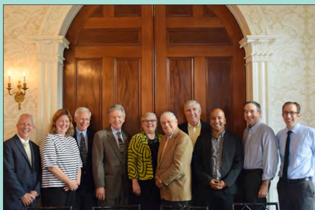
Vinfen's Board of Directors met with many of the conference's thought leaders to discuss the future of technology in community health care.