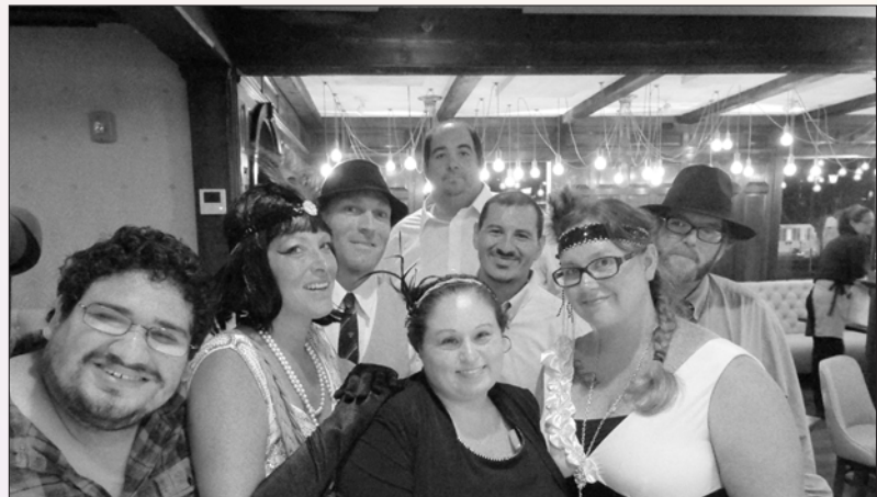
Guests celebrate in 20s style, complete with a photographer taking black and white photos.

Baybridge Clubhouse recently celebrated its 30-year anniversary with their Silence the Stigma Speakeasy event held on September 13 at the West End Restaurant in Hyannis, MA. Evoking the roaring 20s, attendees enjoyed a night of networking, highlights from Clubhouse members, live music, dancing, decadent hors d'oeuvres, DIY mocktails, custom ice cream sandwiches, and a silent auction. A special thanks to the many local businesses who sponsored the event.