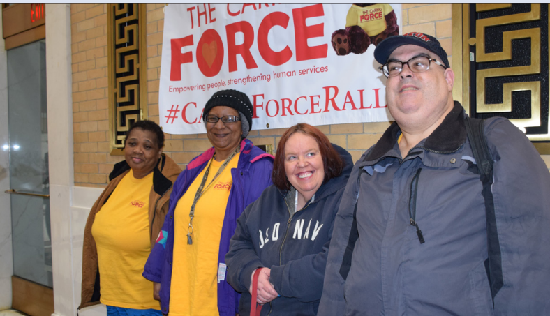
Vinfen members wear their yellow shirts to show their support for The Caring Force.