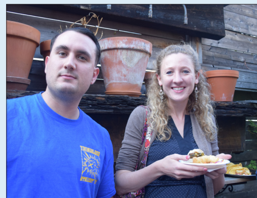
A Run-4-Life event at Atwood's Tavern.

Building a sense of community is important to Vinfen. We are so thankful to have partnered with local businesses who in turn have helped us raise funds and awareness of our mission. Atwood's Tavern in Cambridge, MA has hosted many Run-4-Life events over the years. The Cambridge-based craft business, gather here, donated 5% of their profits on Wednesdays in April to us. The Hot Stove Saloon on Cape Cod stopped taking credit cards and donates the money saved annually to nonprofits like Vinfen, which has received a donation for the past five years. We encourage you to visit these businesses and thank them for their generous support.