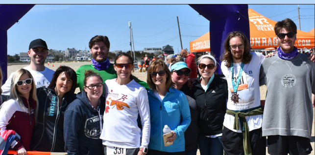
One of the Run-4-Life teams at the finish line.

Thanks to contributions both big and small, this year's Run-4-Life brought in over $30,000. Four teams ran through the night in the 190-mile relay from Hull to Provincetown, MA, raising awareness and funds for people served by Vinfen. Thanks to our sponsors: Pelham Pharmacy; Alexandria Real Estate Equities; Principal Builders; J&F Construction; Morgan, Brown & Joy, LLP; MIT; Afia, Atlantis Investments; Fenway Consulting Group; Mintz Levin Cohn Ferris Glovsky and Popeo PC; Swift Staffing; WastePlace; Watertown Savings Bank; Olympia Moving and Storage; Merchants Leasing; Atwood's Tavern; and Favorite Health Care Staffing.